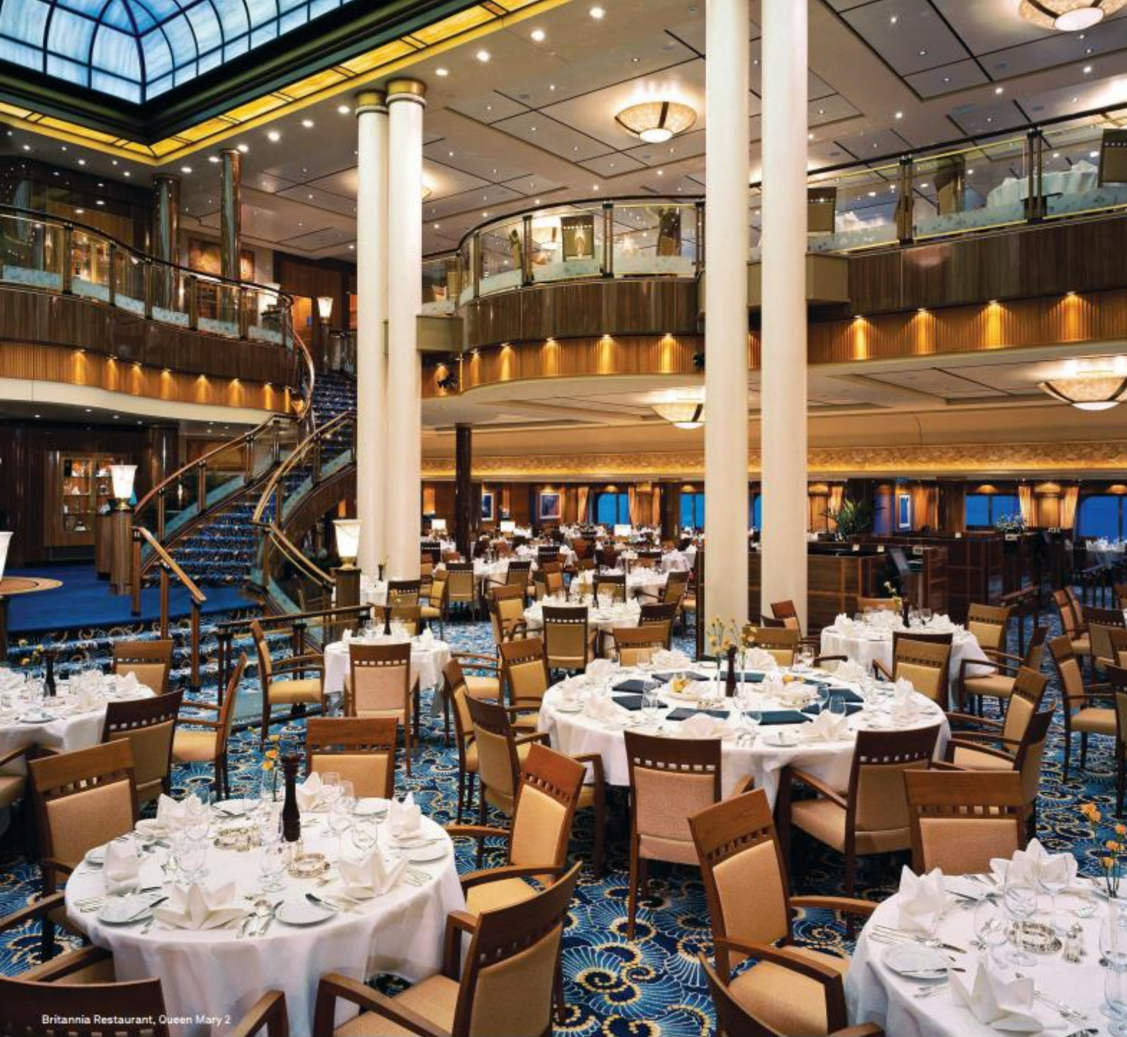
Britannia Restaurant, Queen Mary 2