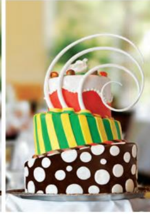
TROPICAL ELEGANCE $9.75 (51-100 guests)