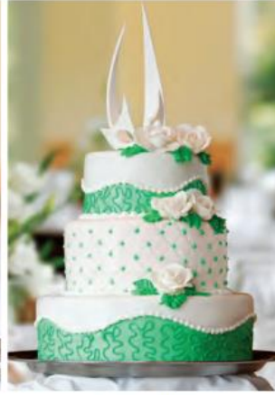
BRIDAL BLISS $9.75 (51-100 guests)