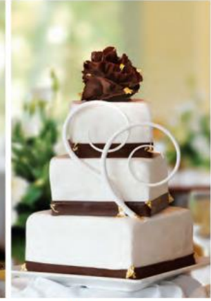
SIMPLE AND SWEET $10 (101-150 guests)

There are no substitutions unless there is an allergy or special dietary reason.