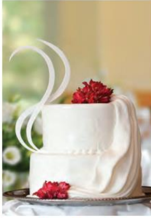
ENCHANTING PEARL $9 (26-50 guests)