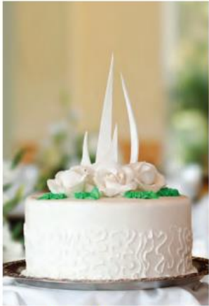
SHIMMERING ROYALTY $7 (up to 25 guests)

Vanilla, Chocolate, Mocha, Coffee, Caramel, Pistachio, Strawberry, Raspberry, Blueberry, Orange, Lemon, Pineapple